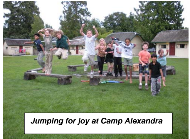
Jumping for joy at Camp Alexandra